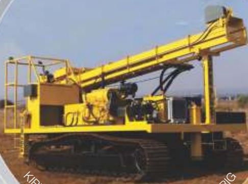
KIRLOSKAR ENGINE POWERING A DRILL RIG