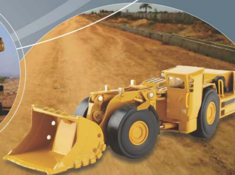
A LOAD-HAUL-DUMPER, POWERED BY A KIRLOSKAR ENGINE